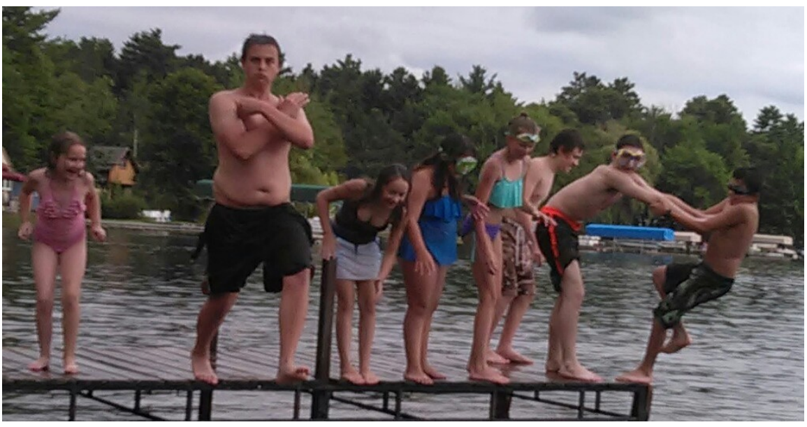
WOOD RIVER BEAVERS 4-H cooled off at the lake.