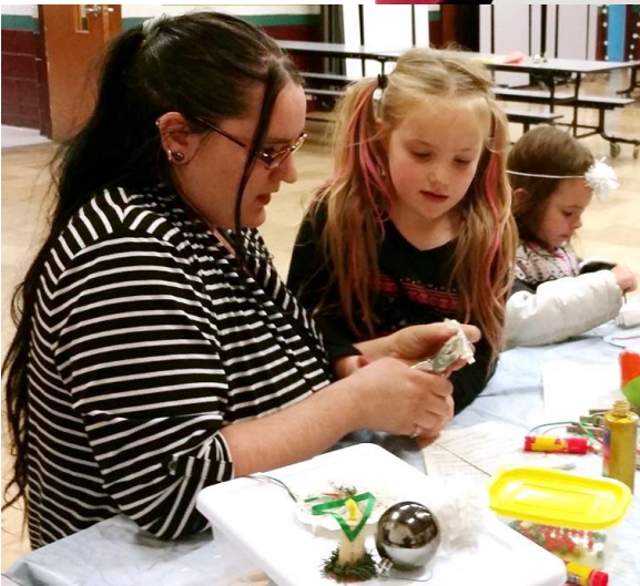
ORANGE 4-H CLUB had their annual Christmas Crafts meeting.