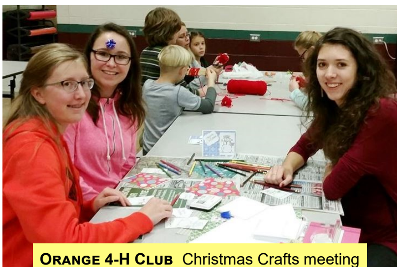
ORANGE 4-H CLUB Christmas Crafts meeting