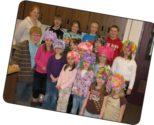
Sewing Bean Bags and Hats with the Cloverbuds!