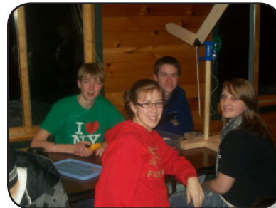
Renewable Energy was the focus of Winter Camp activities. Campers constructed mini wind turbines.