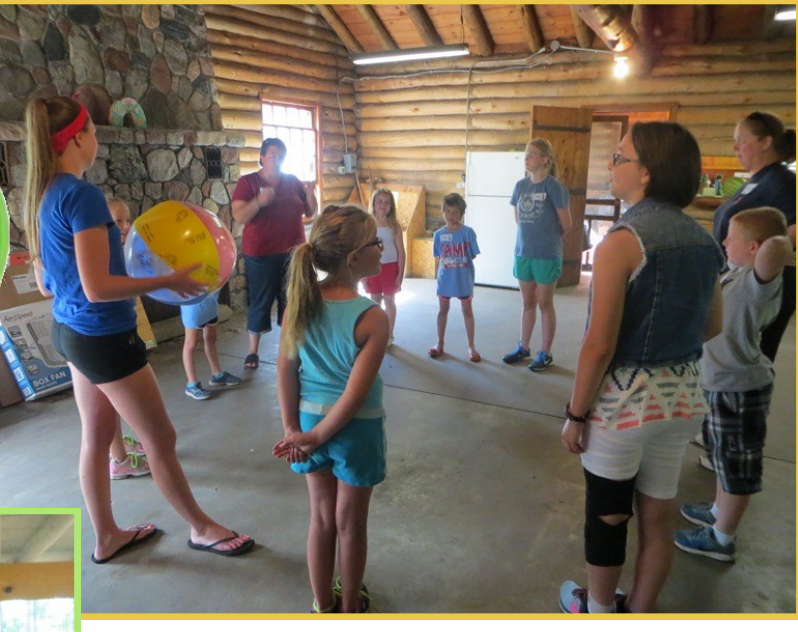
Cloverbuds played getting to know you games.

Cloverbud Day Camp took place on July 13.