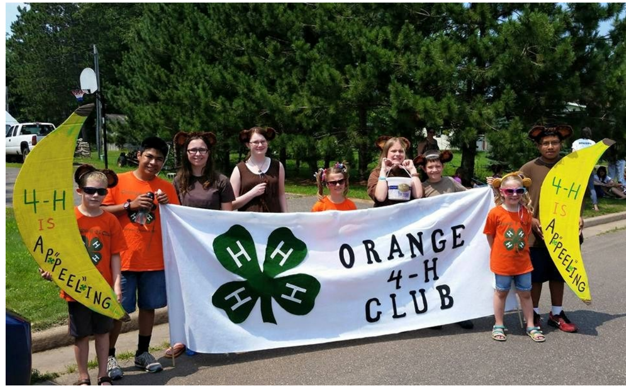
Is it Orange 4-H or a troop of monkeys preparing to march in Webster's 4th of July parade?