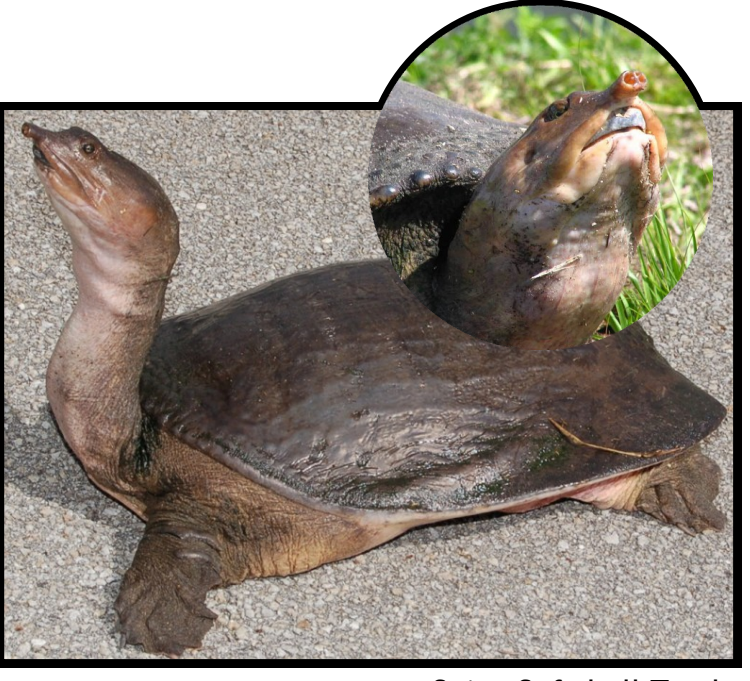
Spiny Softshell Turtle

With its tremendous, webbed feet, the spiny softshell turtle can swim faster than you can run. If you question this, I would suggest that you try to catch one! If you are successful, please handle it carefully as it can inflict a very painful bite with its sharp beak.