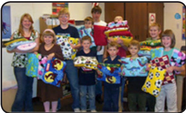
Wood Creek Quillows